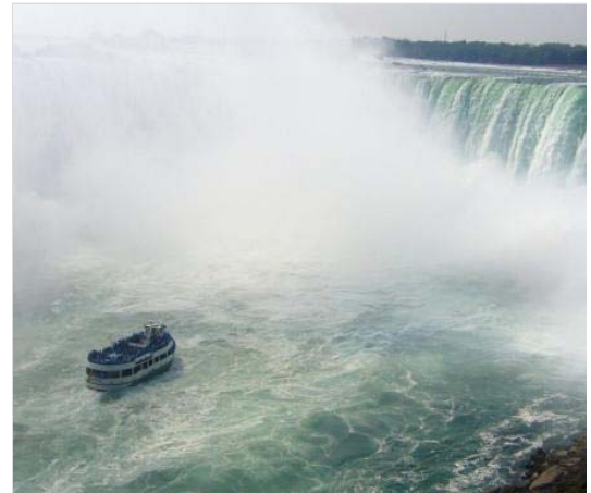
Niagara Falls, Canada: The Clares got a close look the Canadian side of the falls in June 2007. It was "AWESOME," according to their Web site post.

This was the pair's third voyage since 2003 and at more than 5,000 miles, it was the longest distance they've ever sailed.